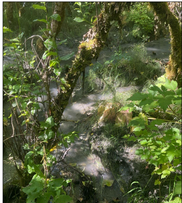
Figure 3.—Braided forest channels at waypoint 1085.