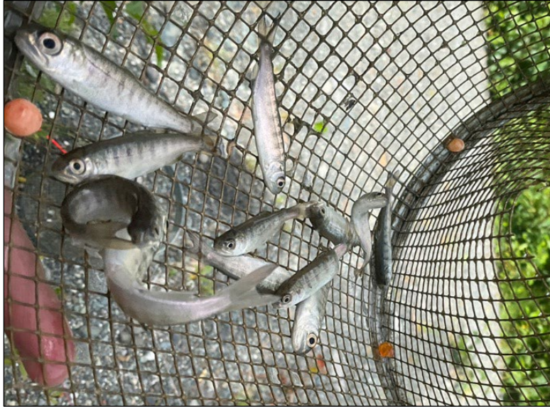
Figure 1.—Juvenile coho salmon caught at waypoint 662.