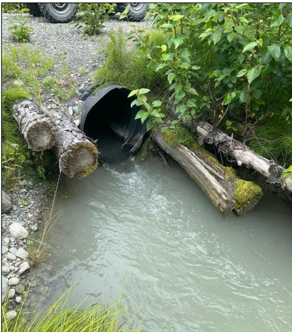
Figure 2.—Culvert outlet at waypoint 662.